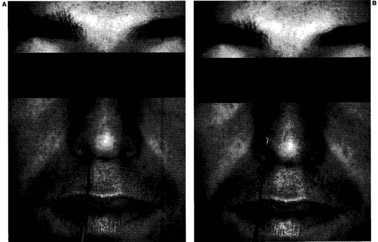
Figure 1. A: Lower lateral cartilage support is performed by using an ear curette to gently support the external nasal valve. B: Position of the curette outside the nose simulates its position within.

the lower lateral cartilage just enough to mimic the support that the patient would be expected to attain with surgical grafting. The same technique is used to elevate the upper lateral cartilage.